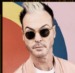
MICHAEL FITZPATRICK '88 Fitz and the Tantrums