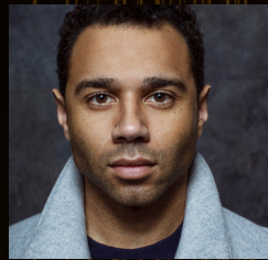
CORBIN BLEU '05 Gala Host